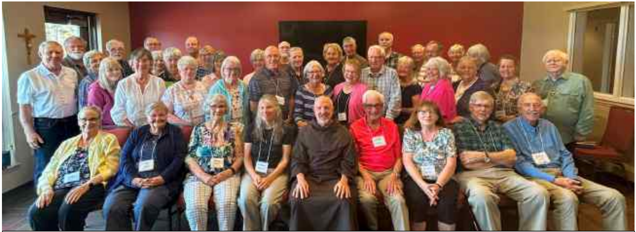
St. Francis of Assisi Fraternity Annual Retreat at Our Lady of Hope Retreat Center, New London, PEI. A number of members from all of the Atlantic Area fraternities attended.