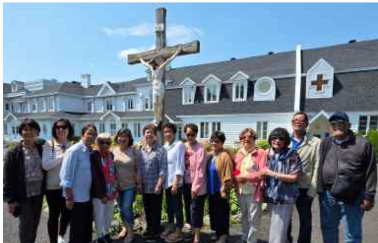
Members of Our Lady of the Philippines Fraternity at our Regional Elective Chapter in Cacouna