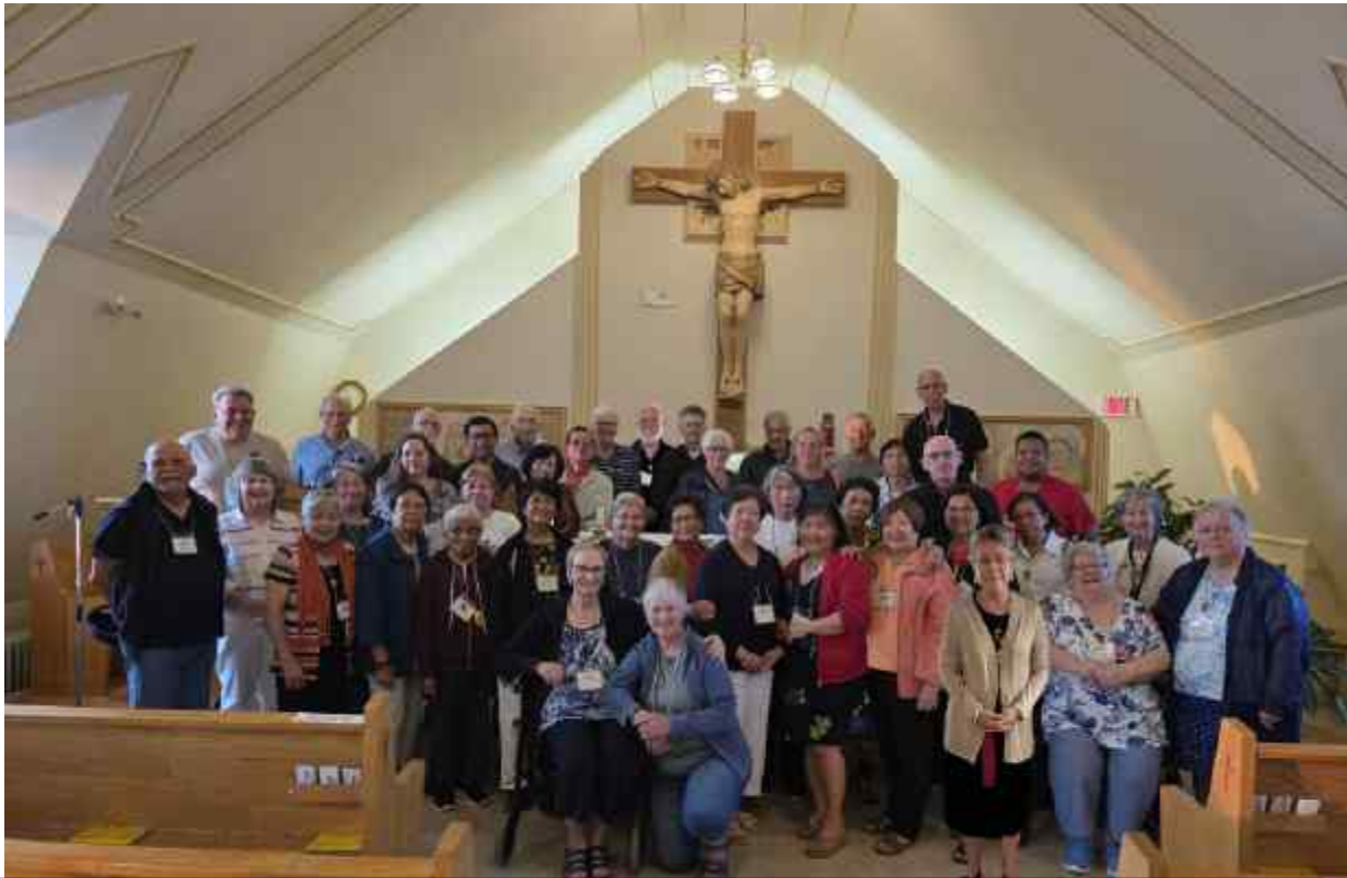
The Regional Fraternity of Eastern Canada Elective Chapter at Le Cénacle, Cacouna, QC, July 18-20, 2025