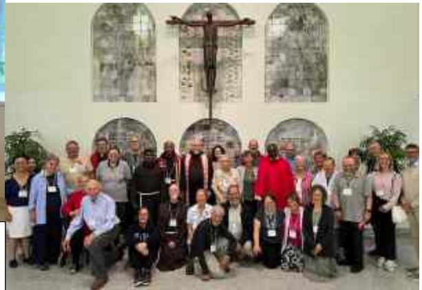
OFS Canada Elective Chapter, Québec City, QC, June, 2025